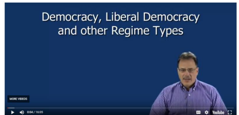
Prof. Larry Diamond, Stanford University